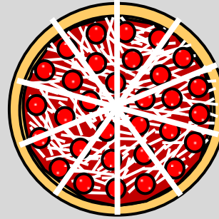
Medium 5 Cuts – 10 Slices