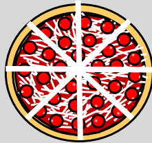
Small 4 Cuts – 8 Slices