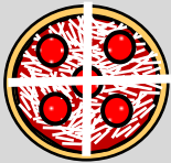
Individual 2 Cuts – 4 Slices