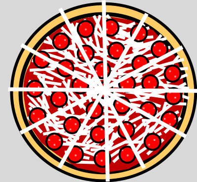
Large 6 Cuts – 12 Slices